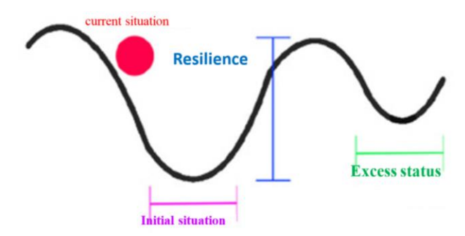
Figure 2: Resilience and its metaphorical states